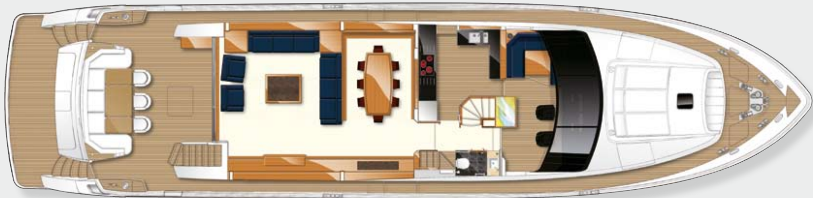
Upper accommodation layout