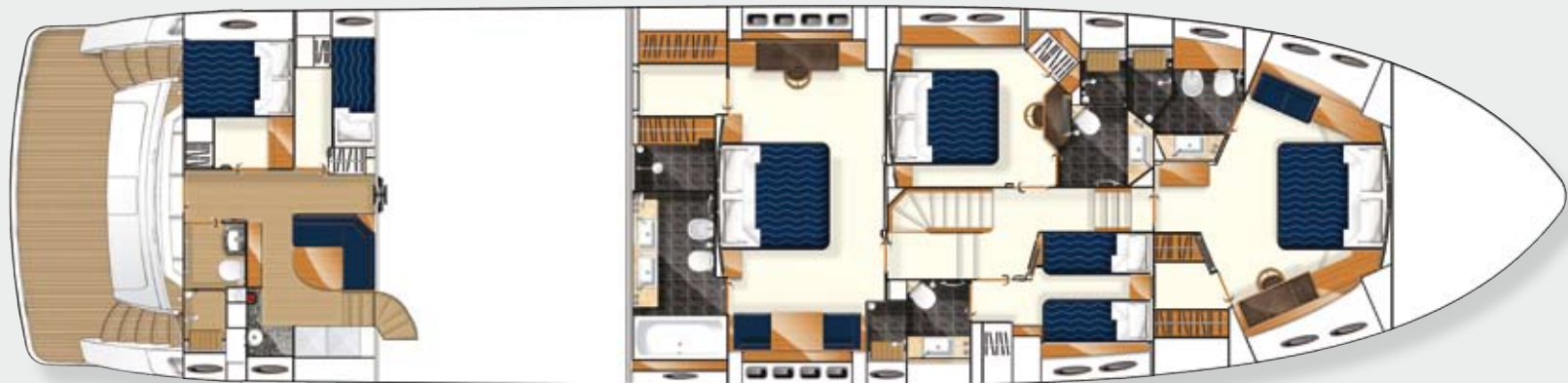
Lower accommodation layout